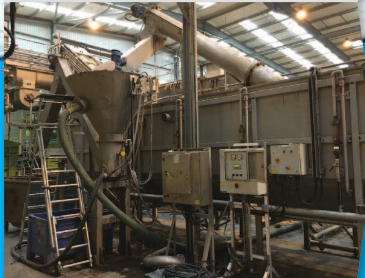
Grit Trap and Washer at Olleco, Westcott Park