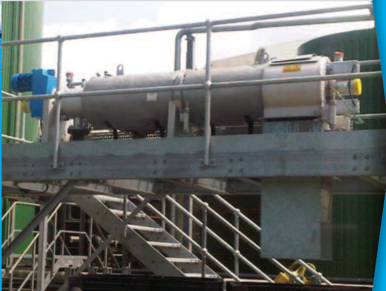
STRAINPRESS® at Andigestion