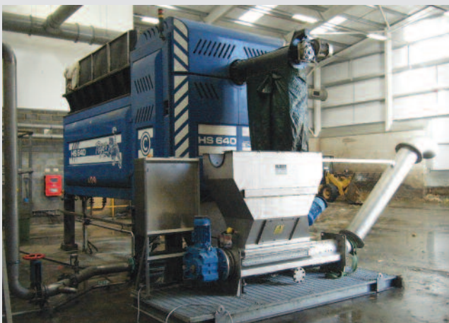
Wash Press washing and compacting reject material at Tamar