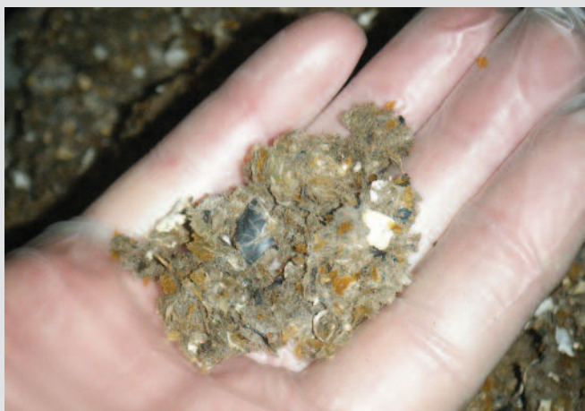
Unwanted plastic particles removed