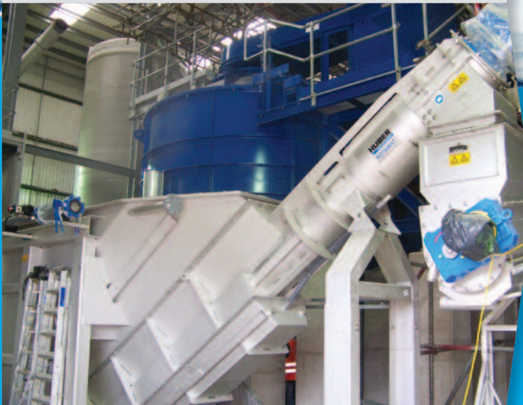
Light Fraction Screen at Bredbury Parkway