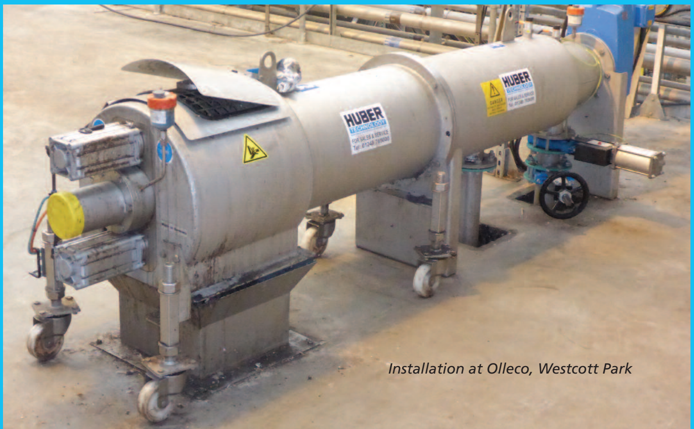
Installation at Olleco, Westcott Park

HUBER TECHNOLOGY were pleased to provide a STRAINPRESS® to ensure that the digestate is free of large plastics particles allowing the digestate to be used as a valuable fertiliser.