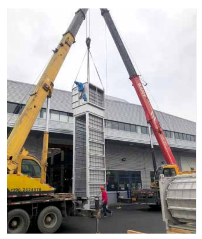
Delivery and installation of a HUBER Belt Screen CenterMax®.

For environmental reasons, the machine can be designed to protect aquatic creatures with fish buckets, which safely remove fish accumulating upstream of the screen and return them to the water body using a launder channel.