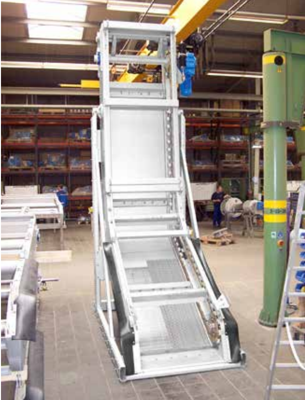
HUBER Rake-Max® HF unit in our factory before delivery: The flat bottom section which provides favourable hydraulic conditions is clearly visible.