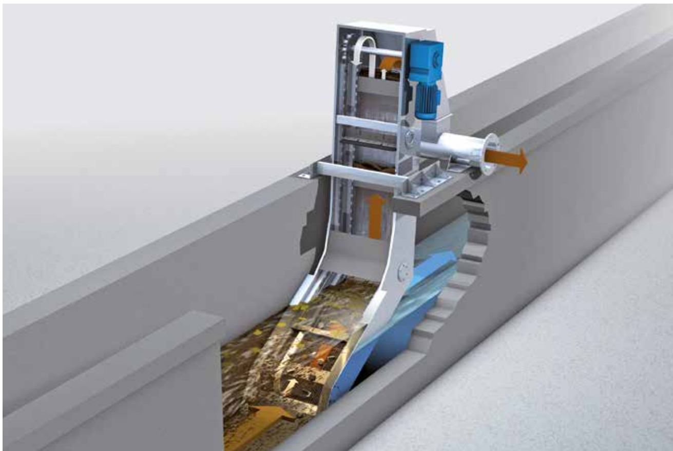
The schematic drawing of the RakeMax® HF screen shows the transition from the flat bar rack providing favourable hydraulic conditions to the steep bar rack section.

Both ends of the cleaning elements are connected to drive chains. Each chain is driven by a sprocket on a common shaft and a flange mounted gear motor. At the end of the bar rack cleaning cycle the cleaning elements are cleaned by a pivoted comb that reliably discharges the removed screenings into a downstream transport, washing or disposal unit. The easy to access and maintain drive unit is installed above the channel. Due to the screen's compact design its height above floor is very low.