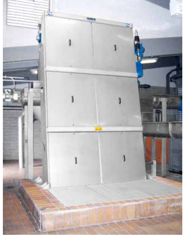
From the outside the HUBER Rake-Max® HF is not distinguishable from a RakeMax® unit, the well-proven basic machine design.