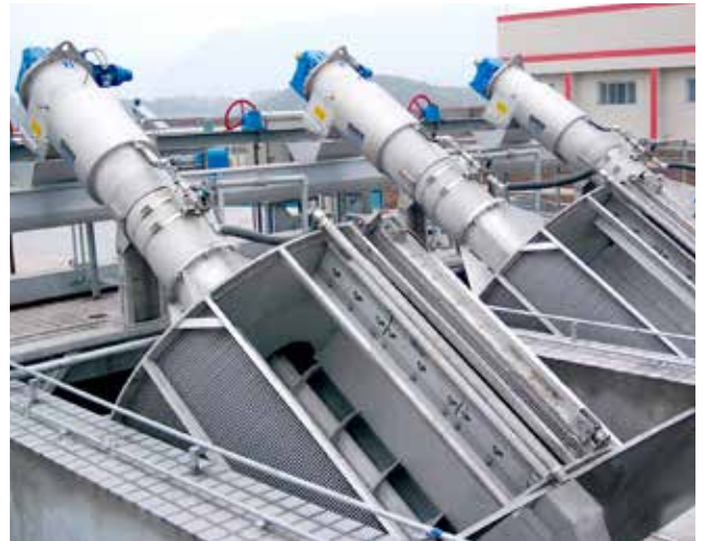
Several parallel HUBER Fine Screen ROTAMAT® Ro1 units installed in the channel.