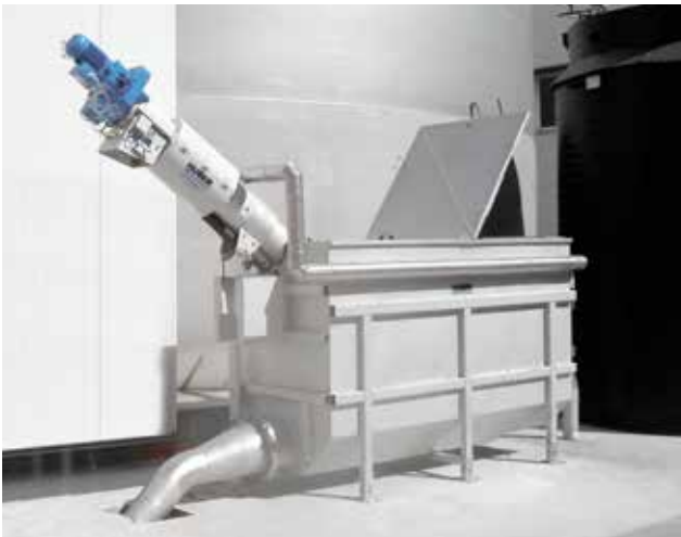
Outdoor installation of the HUBER Fine Screen ROTAMAT® Ro1 in tank.