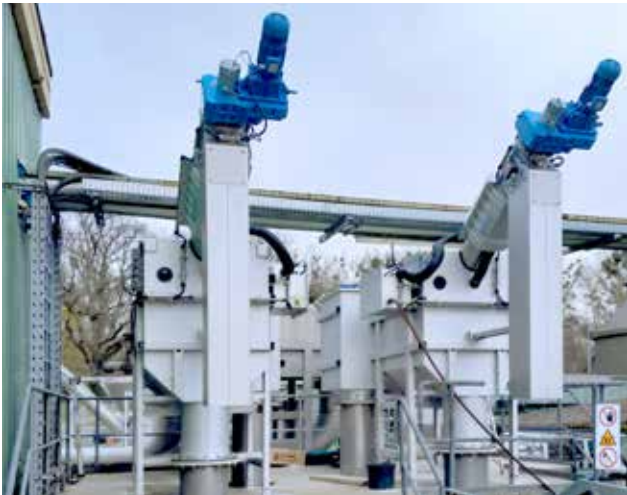
Outdoor installation of HUBER Fine Screens ROTAMAT® Ro1 with heating for frost protection.