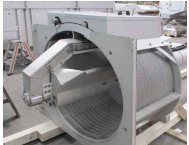
HUBER Fine Screen ROTAMAT® Ro1 with screen basket cover to prevent that splash water escapes.