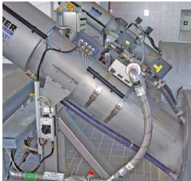
HUBER Fine Screen ROTAMAT® Ro1 with integrated Screenings Washing System IRGA installed in the channel.