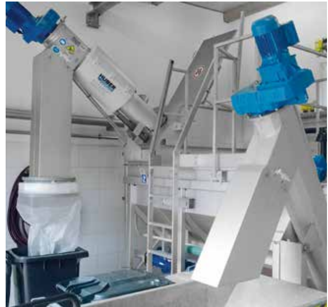
HUBER Complete Plant Hydro Duct ROTAMAT® Ro5 HD with integrated grit washer.