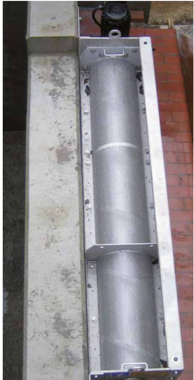
HUBER Storm Screen ROTAMAT® RoK2 installed at a stormwater discharge.

HUBER Storm Screen ROTAMAT® RoK2 screens are horizontally installed at the upstream side of overflow weirs. A screw flight is mounted on a half cylinder of perforated plate. As the stormwater flows through the horizontal perforated half-pipe of the screen trough the solids are retained. A screw, with a brush attached on its flights, rotates within the semi-circular screen trough. It cleans the screen and pushes the separated solids gently towards the lateral discharge. The screenings remain on the polluted water side of the screen from where they are taken along with the wastewater flow. During storm conditions the screen is automatically started and then works fully automatically.