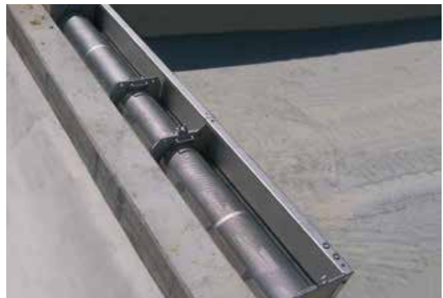
HUBER Storm Screen ROTAMAT® RoK2 after completed installation.