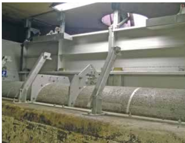
View of the upstream side and lateral screenings discharge opening.