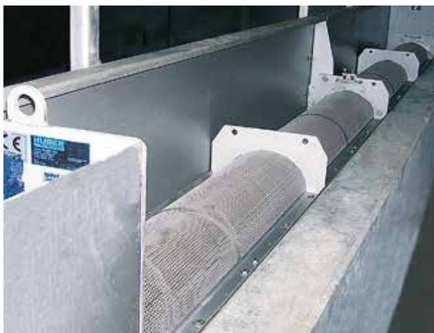
View of the downstream side of a HUBER Storm Screen ROTAMAT® RoK2.