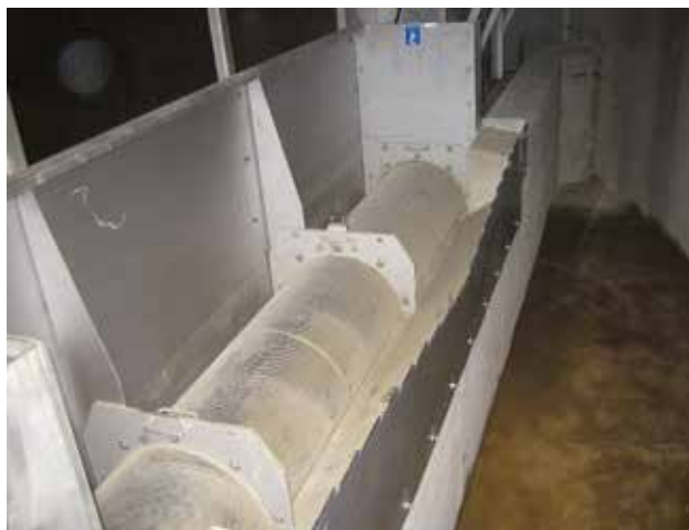
HUBER Storm Screen ROTAMAT® RoK2 with an integrated gauging weir for overflow measurement.