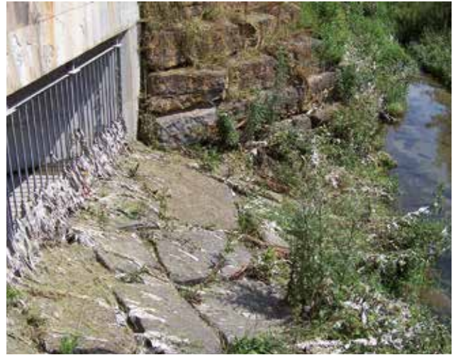
Unsightly matter discharged during storm events, typical for stormwater discharges without coarse material retention.

During and after storm events large amounts of debris are discharged to streams, rivers and lakes through storm water overflows of combined and sanitary sewer systems. Frequently, even the installation of scum boards is insufficient to prevent such pollution. The polluting items, such as sanitary products, toilet paper, faeces, plastic foils, etc. are not only unsightly but also responsible for considerable cleaning and/or disposal costs. On the basis of the DWA sheet A 128 (an instruction issued by an association dealing with wastewater treatment) efforts to fundamentally improve the protection of waters in this sector have been increased. Particularly endangered receiving water courses and nature preservation areas require more extensive measures concerning the treatment of stormwater.