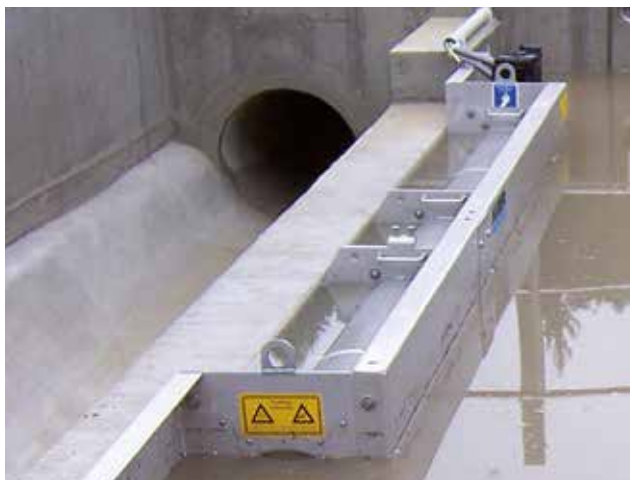
HUBER Storm Screen ROTAMAT® RoK2 before overflow.

A selection of installation examples will convince you of the HUBER Storm Screen ROTAMAT® RoK2