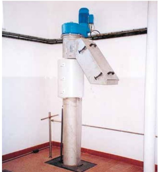
Indoor installation on a small footprint.