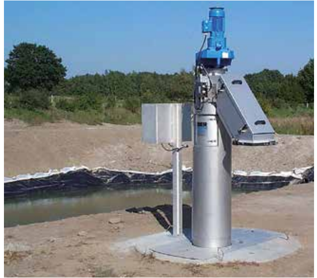
Installation upstream of a pond plant.