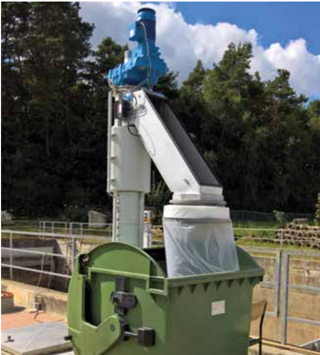
Screenings discharge into a bagger for odour-free disposal.