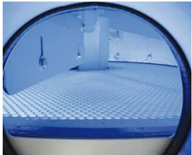
Wear-resistant stainless steel filter cloth.