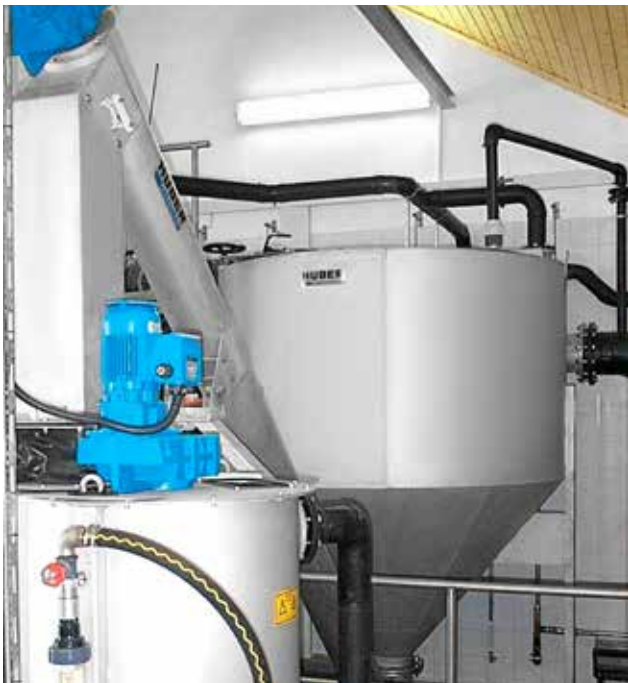
HUBER Circular Grit Trap HRSF with integrated classifying screw and subsequent HUBER Grit Washer RoSF4 T.

The layout of the HUBER Circular Grit Trap HRSF was made on the basis of numeric design engineering and tested and verified under practical conditions in collaboration with the German test institute LGA.