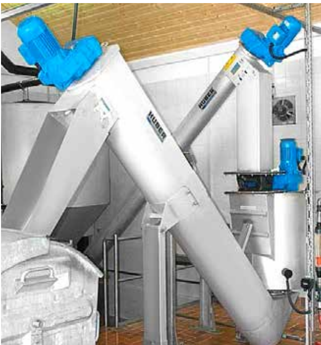
The HUBER Grit Washer RoSF4 T washes the classified grit from a HUBER Circular Grit Trap HRSF.