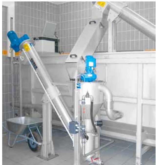
A small HUBER Grit Washer RoSF4 TC washing the classified grit from a HUBER Complete Plant ROTAMAT® Ro5.