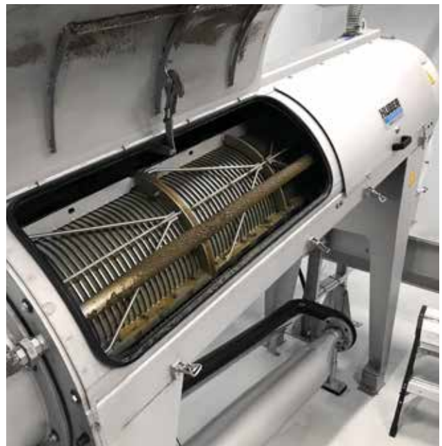
HUBER Screw Press for dewatering of residual sludge from onshore fish farms (salmon production) – reduced disposal costs.