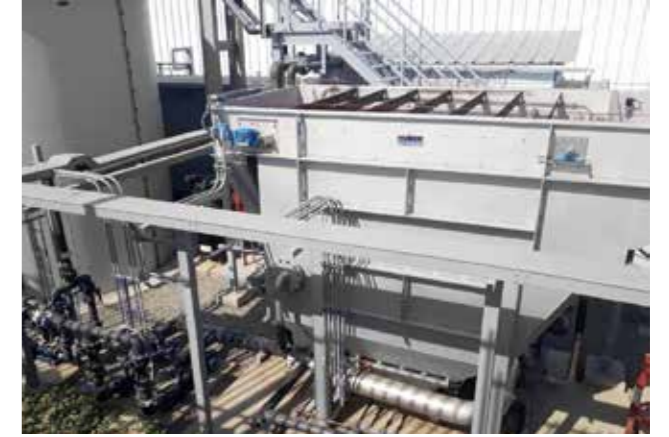
HUBER Dissolved Air Flotation for physical-chemical pre-treatment – optimum reduction of COD, fats and solids, more than 500 installations worldwide.