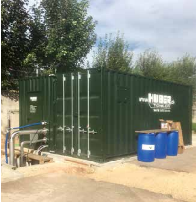
HUBER plant technology in container design – flotation or sludge dewatering units without construction work – ready for immediate use.