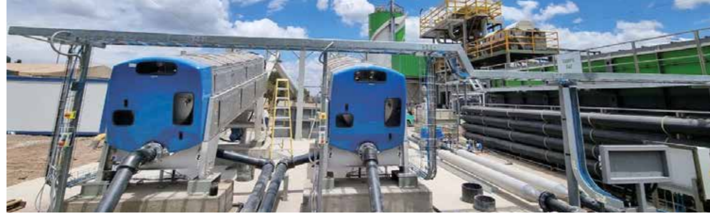
HUBER Screw Press units for sludge treatment – best dewatering performance and highest volume reduction for lower disposal costs.