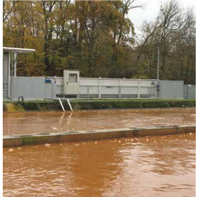
HUBER Dissolved Air Flotation systems for sludge separation and effluent treatment – the solution for upgrading overloaded wastewater treatment plants.