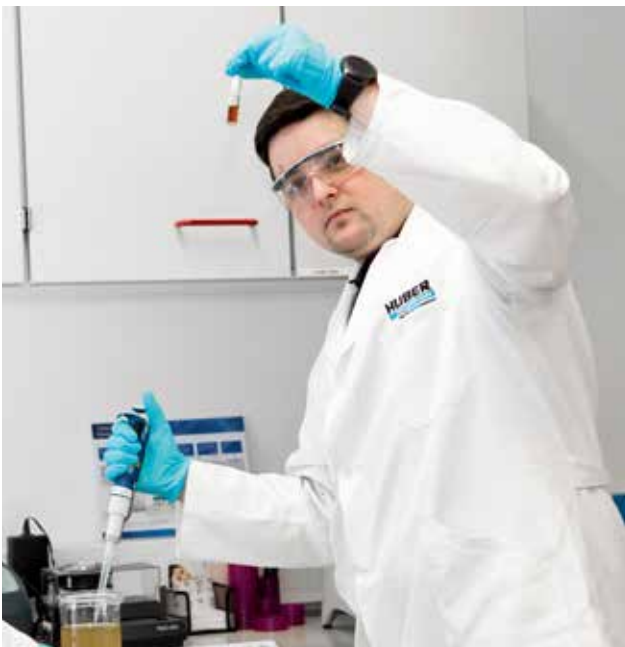
Preliminary tests in the laboratory or on site to determine operating parameters and effluent values – safety for customers and operators.