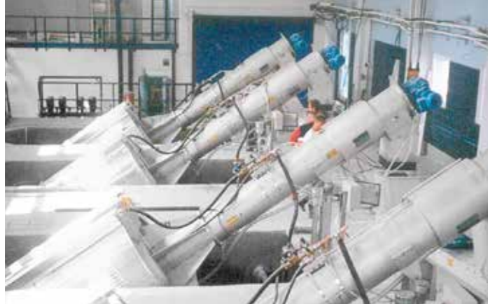
HUBER screening systems for mechanical pre-treatment – efficient, durable and well proven.