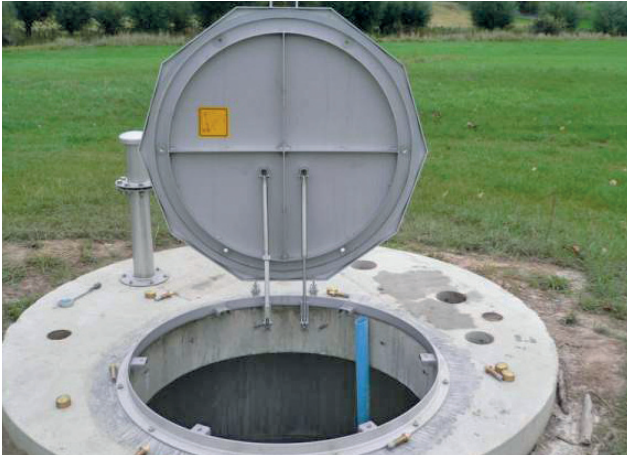
The figure shown here may contain special accessories

Manhole cover , watertight up to 1 m head of water, round in shape, completely made of 1.4307 (AISI 304 L) stainless steel.