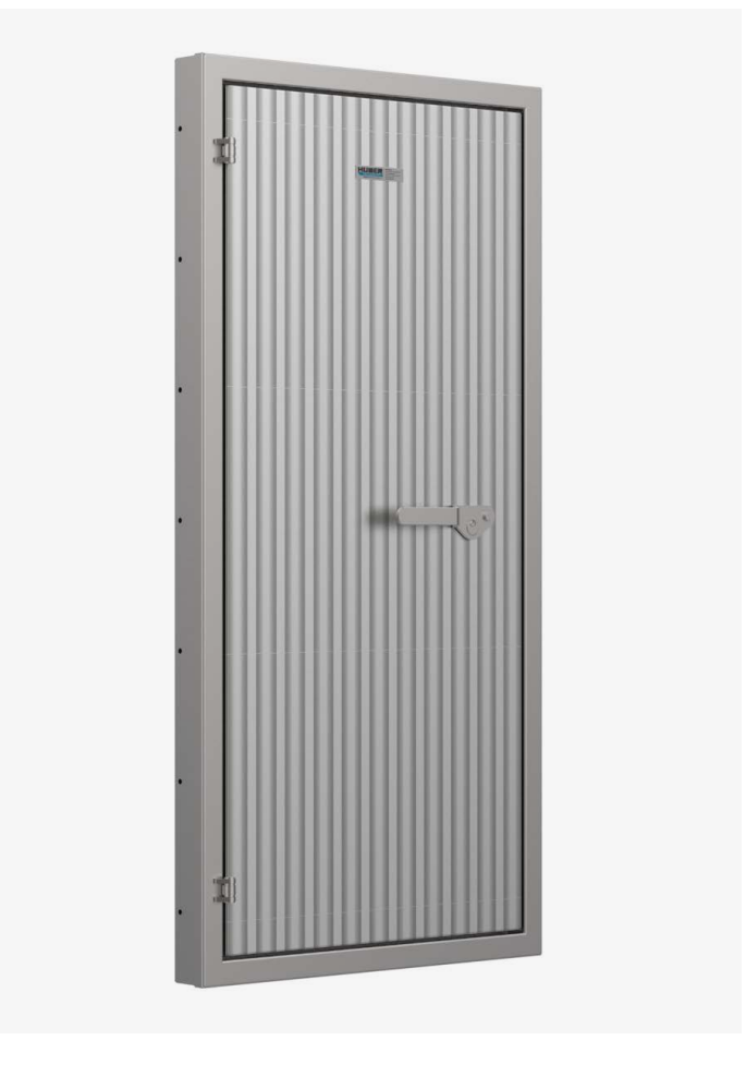
The figure shown here may contain special accessories.

Access door especially for areas at risk of flooding.