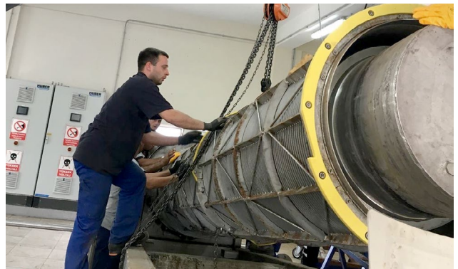
Conserving resources – in the spirit of sustainability.