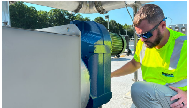
Comprehensive service expertise from a single source.