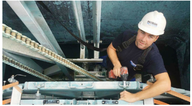
Successful start of operation through professional installation and commissioning.