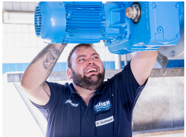
Efficient and professional execution.