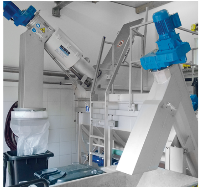
HUBER Complete Plant Hydro Duct ROTAMAT® Ro5 HD with integrated grit washer.