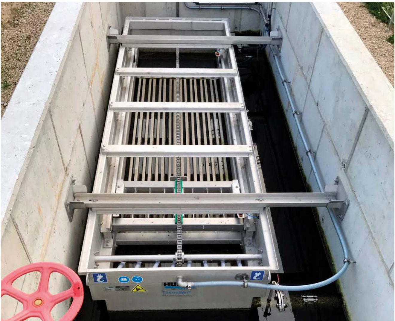
HUBER Heat Exchanger RoWin C installed in a concrete tank. The flow streams through the heat exchanger by gravity.

pumping energy is required. This avoids costs and significantly improves the economic efficiency of such plants. The HUBER Heat Exchanger RoWin C can make an important contribution especially to energy-efficient retrofitting of sewage treatment plants. Due to its compact design and installation in a channel or tank, no additional installation space is required and the available space utilised at an optimum. But biofilm growing on the heat exchanger surfaces cannot completely be ruled out with the use of the WWTP effluent. Integrated cleaning of the heat transfer surfaces therefore is of great importance to continuously maintain the maximum heat transfer capacity. Several HUBER Heat Exchanger RoWin units can be installed in parallel or in series for perfect adjustment to specific site conditions and customer requirements. Combined with load-bearing covers the units can also be installed under parking areas for example.